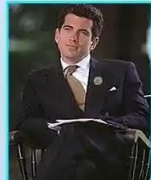
- John F Kennedy Jr. 19th Vice President