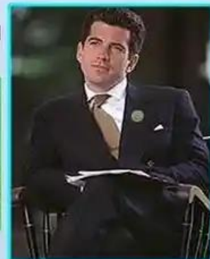
- John F Kennedy Jr. 19th Vice President