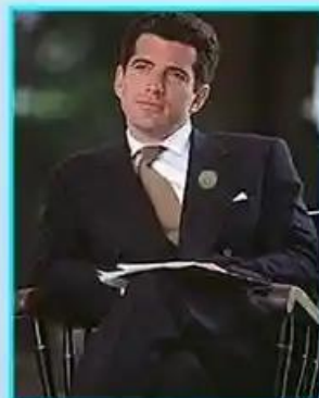
- John F Kennedy Jr. 19th Vice President